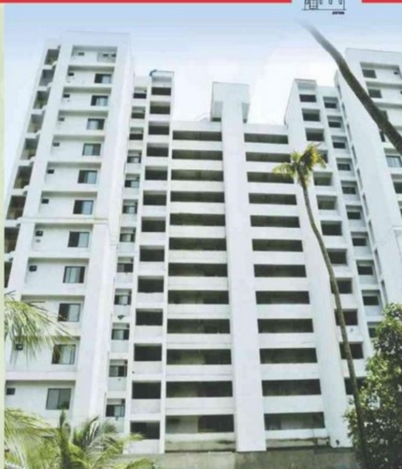
KOCHI VADUTHALA (RAM PRAKASH VIHAR) 76 DWELLING UNITS