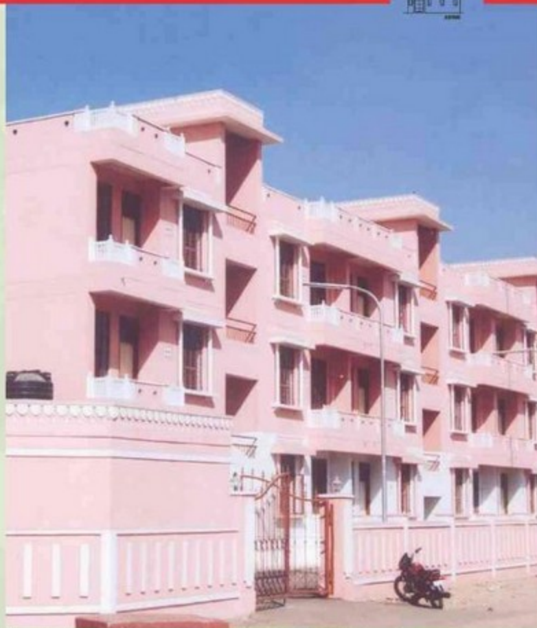
JAIPUR JAI JAWAN AWAS YOJANA (RAKESH VIHAR) 168 DWELLING UNITS