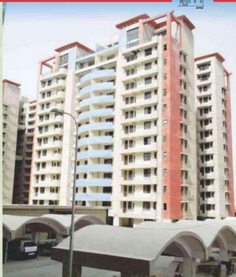
GREATER NOIDA (GURJINDER VIHAR) 2822 DWELLING UNITS